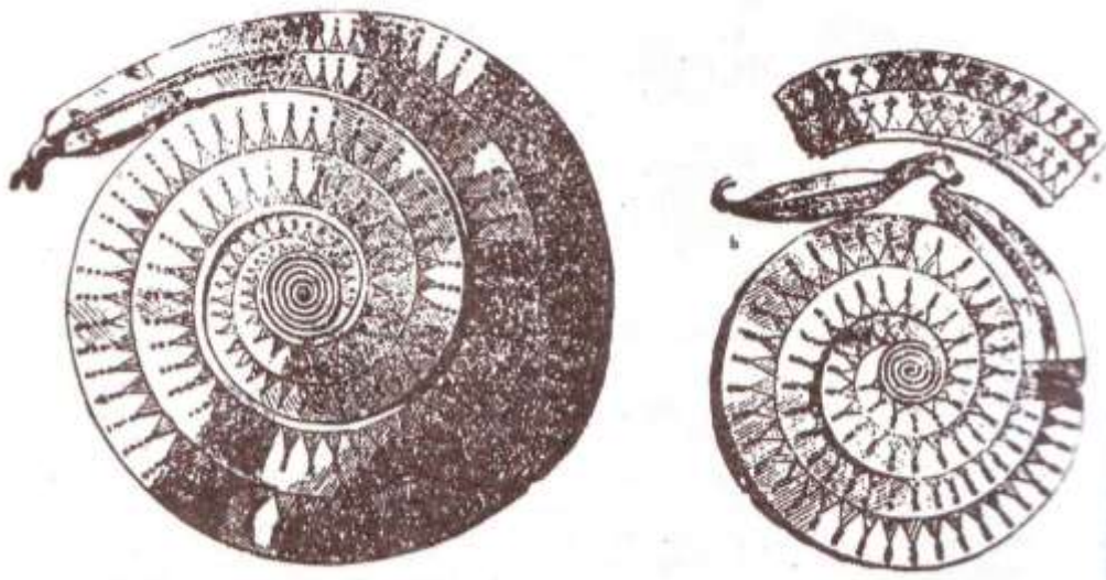
Dacic Symbol (Dacia are the first Name of Romania)