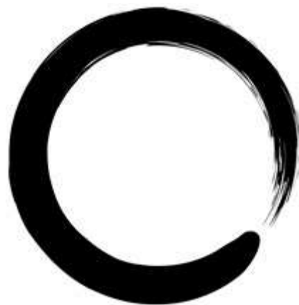
Great Void or Wu Ji